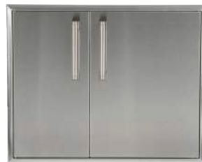
31" DRY PANTRY WITH DRAWERS Model No. CDPC31