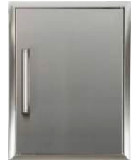
20" x 14" SINGLE ACCESS DOOR Model No. CSA2014