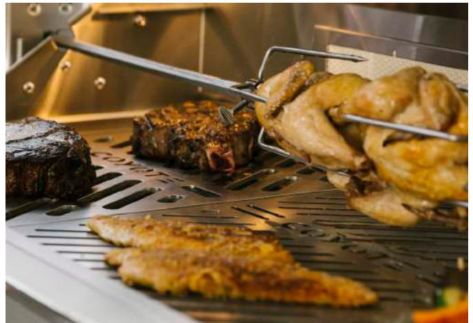
Model No. CSIGRATE (-15 or -12)