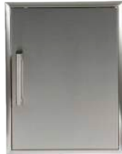
24" x 17" SINGLE ACCESS DOOR Model No. CSA2417