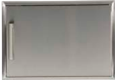
17" x 24" SINGLE ACCESS DOOR Model No. CSA1724