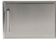
14" x 20" SINGLE ACCESS DOOR Model No. CSA1420