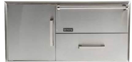
42" COMBO DRAWERS Model No. CCD-WD