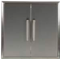
26" DOUBLE ACCESS DOORS Model No. CDA2426