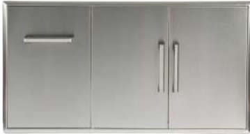
45" COMBO DRAWERS Model No. CCD-POD