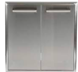
27" DUAL PULL OUT TRASH AND RECYCLE Model No. CTC