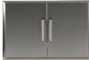
36" DOUBLE ACCESS DOORS Model No. CDA2436