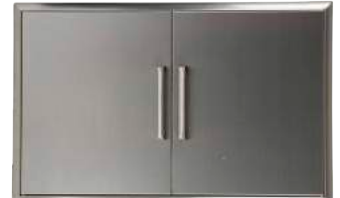
39" DOUBLE ACCESS DOORS Model No. CDA2439