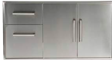
45" COMBO DRAWERS Model No. CCD-2DC