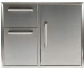
31" SINGLE DOOR AND 2 DRAWERS Model No. CCD-2DC31