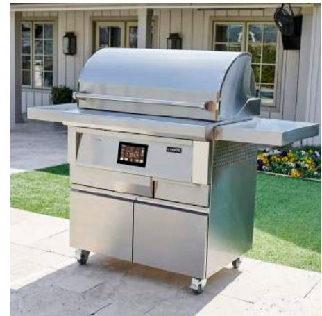
(Model No. C1P36-FS)