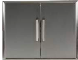
31" DOUBLE ACCESS DOORS Model No. CDA2431