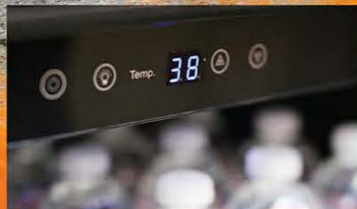
Digital Temperature Display