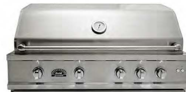
42" Build-in Grill 421BQRL