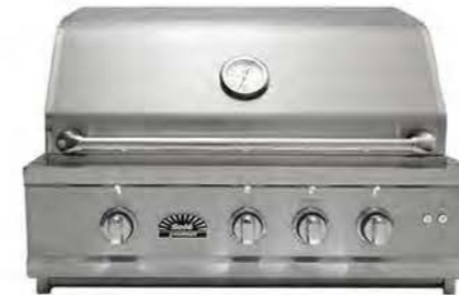
30" Build-in Grill 301BQRRL

Solé Luxury Series Grills feature a flat stainless steel bezel on top and overlapping control panel for a seamless professional look without the need for custom trim.