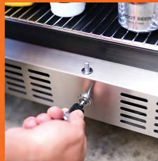
Key lock for securing your items.