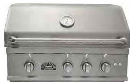
32" Build-in Grill 321BQTRL