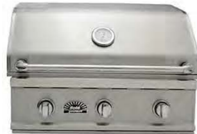
32" Build-in Grill 320BQTR