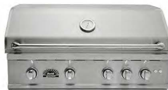
38" Build-in Grill 381BQTRL