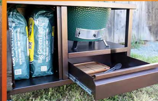
Spacious storage cabinet and drawer holds all the essentials with ease.