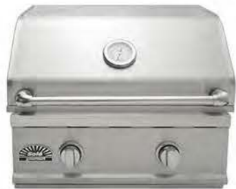
26" Build-in Grill 261BQTR

Solé TR Series Grills feature easy slide-in that is ideal for quick, simple installation for recessed designs or islands with custom trim.